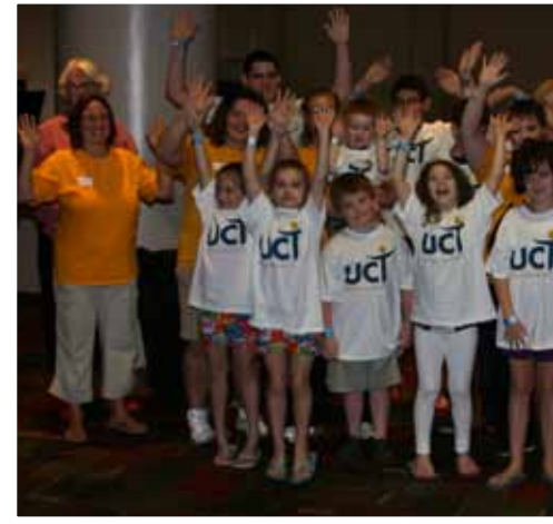
The first of three years UCT provided the services of Corporate Kids. Many activities were scheduled including a trip to the Indianapolis Zoo. Each youth received a T-shirt sporting the new UCT logo and a special tag line "The Future of UCT."